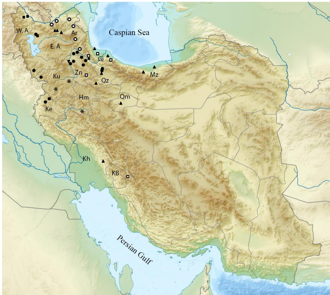
FIGURE 1. Map of Iran; indicating the sampling localities of Platyarthrus schoblii (▲), Trichorhina tomentosa (▼), Armadillo alievi (■), A. officinalis (*), Armadillidium azerbaijani (●), A. nasatum (◻) and Schizidium golovatchi (•). Ar: Ardabil; E. A: Eastern Azarbaijan; Gi: Guilan; Hm: Hamedan; K.B: Kohgilouyeh-Boyerahmad; Ke: Kermanshah; Kh: Khuzestan; Ku: Kurdistan; Mz: Mazandaran; Qm: Qom; Qz: Qazvin; W.A: Western Azarbaijan; Zn: Zanjan.