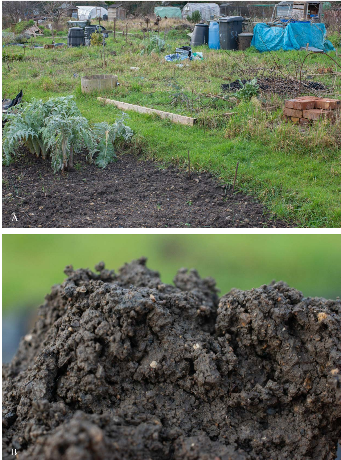
Figure 3: Habitat of Metatrichoniscoides celticus at Horfield Allotments. A) Bare allotment soil from which specimens were collected; B) Closeup on soil macropores. (Images © Frank Ashwood).

To date, eight individuals (two males, four females and two juveniles) have been collected from a single 1 m 2 patch of soil. The specimens were all recovered following shallow digging (to approx. 10 cm depth), removing and breaking apart large clayey soil clods, and inspecting exposed macropores, in which the woodlice reside (Fig. 3B).