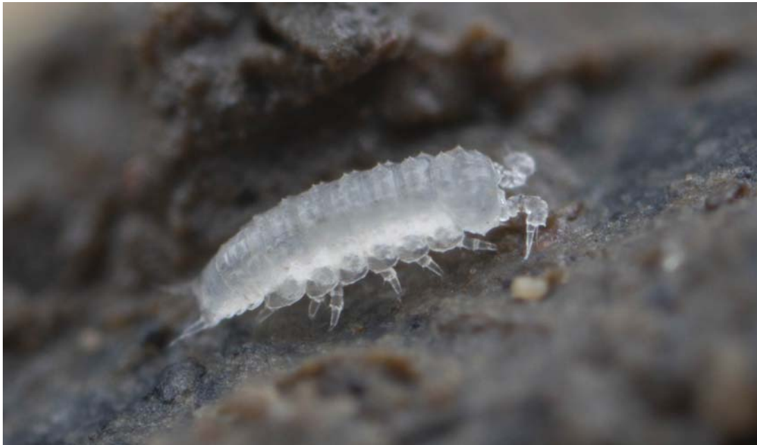
Figure 1: Metatrichoniscoides celticus immature live specimen from Horfield Allotments. Live macrophotograph in-situ.

macrophotograph was posted online to BMIG's Isopods and Myriapods of Britain and Ireland group ( www.facebook.com/groups/407075766387553 ) by FA (Fig. 1). The image drew a lot of attention and subsequently FA forwarded the preserved specimens to SJG for species determination.