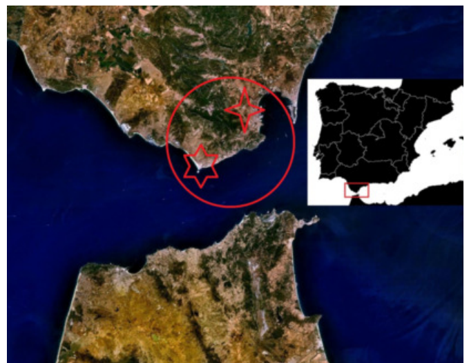
Figure 1. Record sites of Paraschizidium hispanum in the Iberian Peninsula (Strait of Gibraltar area): four pointed star, Arcangeli (1935); six pointed star, present record.

The recent finding of a population of P. hispanum in Tarifa, in the same Andalusian province, means its rediscovery after almost 90 years without any records. Its morphological study confirms its correct inclusion in the genus Paraschizidium Verhoeff, 1919. In this paper, the main distinctive characteristics of P. hispanum have been illustrated again to facilitate future identifications. Some taxonomic, ecological and biogeographical aspects have also been discussed.