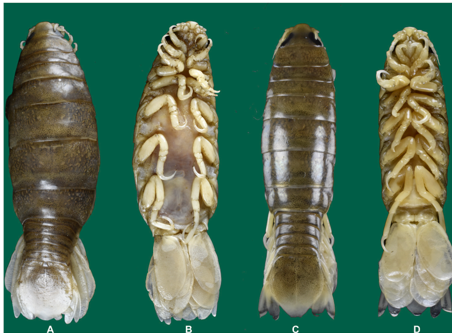
Fig. 4. Anilocra grandmaae n. sp. ovigerous female paratypes. (A–B) Dorsal and ventral view of ovigerous female (35.0 mm; ZSI/WGRC/IR. INV./14612). (C–D) Dorsal and ventral view of non-ovigerous female (28.0 mm; ZSI/WGRC/IR. INV./14615).