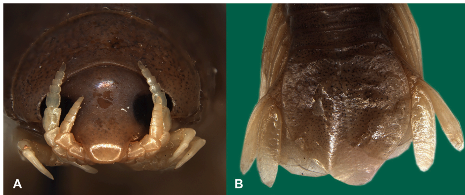
Fig. 5. Anilocra grandmaae n. sp. ovigerous female (34.0 mm; ZSI/WGRC/IR. INV./12329). (A). Cephalon frontal view. (B). Pleotelson and uropods.

as long as anterior width, dorsal surface with two sub-medial depressions, lateral margins convex, not folded. Posterior margin converging to caudomedial point. Anterodorsal depression and medial longitudinal ridge are weakly developed.