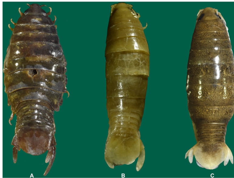
Fig. 2. (A) Anilocra capensis Leach, 1818 (Leach, 1818 lectotype (43.0 mm; BMNH 1979.329:207b). (B) Anilocra paulsikkeli Welicky and Smit, 2019, paratype (32.0 mm; SAMC-A091295). (C) Anilocra grandmae n. sp. paratype (34.0 mm; ZSI/WGRC/IR. INV./12329).