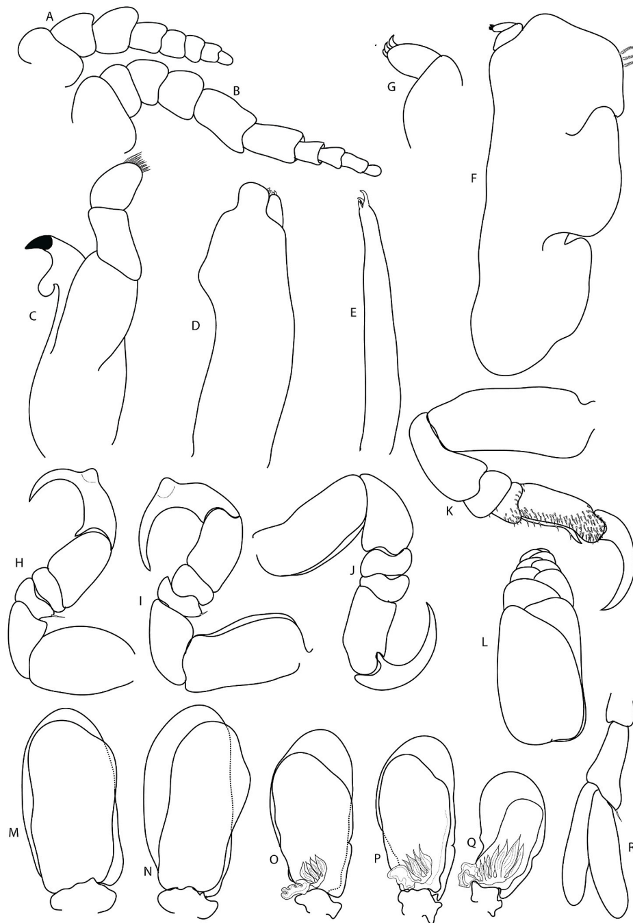
Fig. 6. Anilocra grandmaae n. sp., ovigerous female paratype (34.0 mm; ZSI/WGRC/IR. INV./12329). (A) Antennula. (B) Antenna. (C) Mandible. (D) Maxilla. (E) Maxillula. (F) Maxilliped. (G) Distal segment of maxilliped palp. (H) Pereopod 2. (I) Pereopod 3. (J) Pereopod 5. (K) Pereopod 6. (L) Brood pouch. (M–Q), Pleopod 1–4. (R) Uropod.