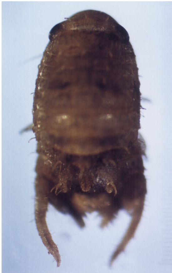
Fig. 1. Paracerceis sculpta (Holmes, 1904).

Pereopods with simple, well developed, acutely produced accessory unguis (Fig. 3A, B, C). Pleopods 1-2 as illustrated in Fig. 3D, E. Uropodal rami (Fig. 2A) densely setose, almost uniramus, endopod highly reduced, exopod well developed, long, slender and curving inward.