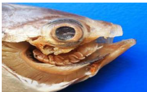
Fig 2. Norileca indica Milne-Edwards, 1840 inside the buccal cavity of Rastrelliger kanagurta (Cuvier, 1816).