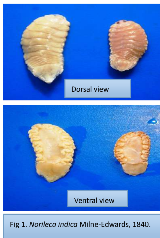
Fig 1. Norileca indica Milne-Edwards, 1840.

Norileca indica Milne-Edwards, 1840 is widely distributed in Indo-West Pacific region: most commonly in Sumatra, Indonesia, Philippines, New Guinea, north-western Australia, Madagascar, China and Thailand (Rameshkumar et al., 2014c). In Indian coastal water the distribution of Norileca indica Milne-Edwards, 1840 present in table 1 and