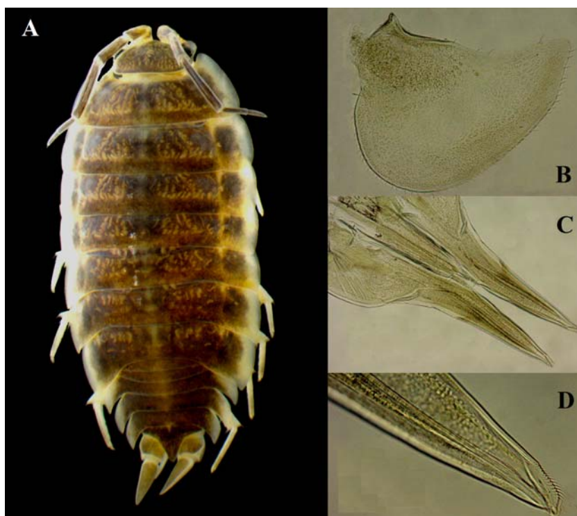
Fig. 2. Protracheoniscus major , 12 mm, ♂, dorsal view (A), exopod-pleopod I (B), endopod-pleopod I (C) and tip of endopod-pleopod I (D). Рис. 2. Protracheoniscus major , 12 мм, ♂, общий вид (A), экзопод плеопода I (B), эндопод плеопода I (C) и вершина эндопода плеопода I (D).