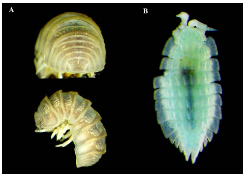
Fig. 1. General view of Armadillo alievi , ♀, 5 mm (A) and Platyarthrus schoblii , ♂, 1 mm (B). Рис. 1. Общий вид Armadillo alievi , ♀, 5 мм (A) и Platyarthrus schoblii , ♂, 1 мм (B).