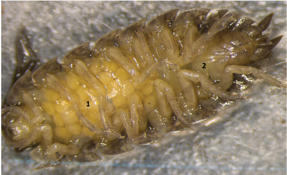
Figure 1. Ventral view of the intersex specimen of P. scaber with multiple eggs in the marsupium (1) and a male pleon (2).