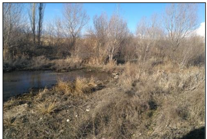
Fig 2: Habitat of Schizidium davidi (Dolfuss, 1887) (Uzuntarla Village)