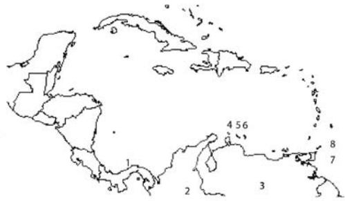
Fig. 1. Southern Caribbean countries: (1) Panamá, (2) Colombia, (3) Venezuela, (4) Aruba, Netherlands Antilles islands of (5) Curaçao and (6) Bonaire, Trinidad and Tobago islands of Trinidad (7) and Tobago (8).

Fishes were obtained from fish markets after having been captured by trawl, traps, trammel nets, spearing, and hook and line. The external surfaces, mouth and gill chambers of