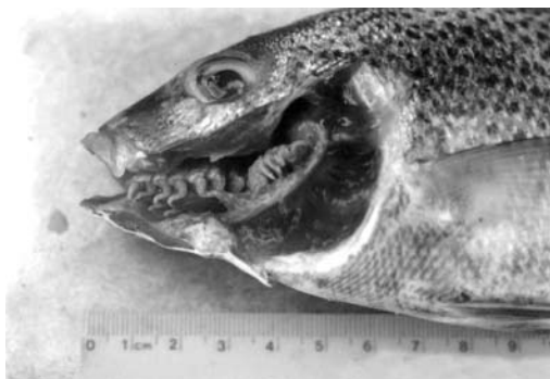
Fig. 6. Lateral view of a female Cymothoa sp. of Bowman and Diaz-Ungria attached to the tongue, and a male attached on top of the left gill rakers, of a Corocoro, Orthopristis ruber (Cuvier) collected at a fish market in Carúpano, Venezuela, 12 July 1999. Left operculum and left side of mouth were excised to expose the attachment positions.

Fig. 6. Vista lateral de una hembra de Cymothoa sp. de Bowman y Diaz-Ungria adherida a la lengua, y de un macho adherido en la parte superior de las branquias de un Corocoro, Orthopristis ruber (Cuvier), recolectado en un mercado de Carúpano, Venezuela, 12 de julio de 1999. El opérculo izquierdo y el lado izquierdo de la boca fueron extirpados para exponer las posiciones de adhesión.