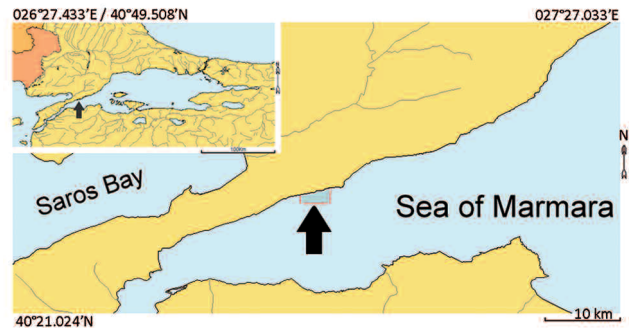
Figure 1. Map of the location area of the sampling stations. The indicated part is the frame of the area that the stations are located.

Body well developed, length 1.1 mm, a brown stain string extends from the cephalic end to the second thoracic disc comprising the lateral edges of the eyes which are well developed and pigmented in brownish red, a brownish blot affects the entire posterior aspect of the body and extends through several segments almost up to the lateral edges, on another five segments occupies the middle part. There is no pigment in the four subsequent thoracic segments,