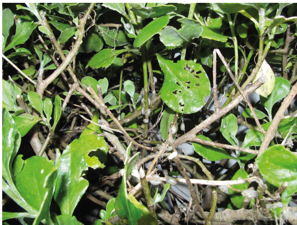
Fig. 3. Photograph at night of individuals of the isopod Tylos capensis climbing on stems and leaves of the bietou bush Chrysanthemoides monilifera rotundata along a walkway near The Promenade of Umhlanga beach, South Africa. Note the holes and cut-out margins of some of the leaves indicating feeding activity.

Tylos capensis exhibits an unusual behavior for a terrestrial isopod: it not only eats live leaves still connected to a plant (rather than dropped as litter), but also climbs up stems as high as 1 metre or more above the ground to reach them. Furthermore, it can