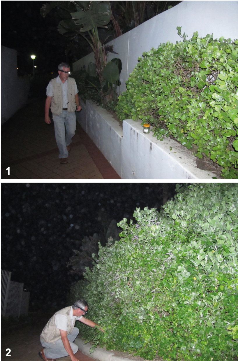
Figs 1, 2. Photographs at night of senior author D.S. Glazier near rows of bietou bushes Chrysanthemoides monilifera rotundata along walkways near The Promenade of Umhlanga beach, South Africa. These are two of the sites where numerous individuals of the isopod Tylos capensis were observed climbing on bietou bushes.

edges), whereas those from Yzerfontein were thicker (more succulent) and more smoothly rounded, thus more closely matching those of the subspecies C. monilifera rotundata observed at our field site in Umhlanga (cf. Weiss et al. 2008). However, the