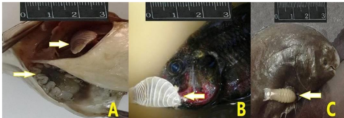
Fig. 2: A: L. redmanii adult male and female in the branchial cavity (upper and lower respectively) of Mugil capito , B: adult L. redmani attached to the gill cover of Tilapia zilli , C: Juvenile of L. redmanii attached to the base of pectoral fins of Solea species .

The mean concentrations of the tested heavy metals showed that levels of copper (36 µg/L) and mercury (1.902 µg/L) were extremely higher than the maximum permissible limits (10 µg/L and 0.4 µg/L; respectively). Also, the recorded mean concentration of Lead (7.138 µg/L) was found higher than the average acceptable limit (5 µg/L), but was within the maximum permissible limit (20 µg/L). On the other hand, the recorded mean concentration of arsenic (2.5 µg/L), was lower than the average acceptable limit (36 µg/L).