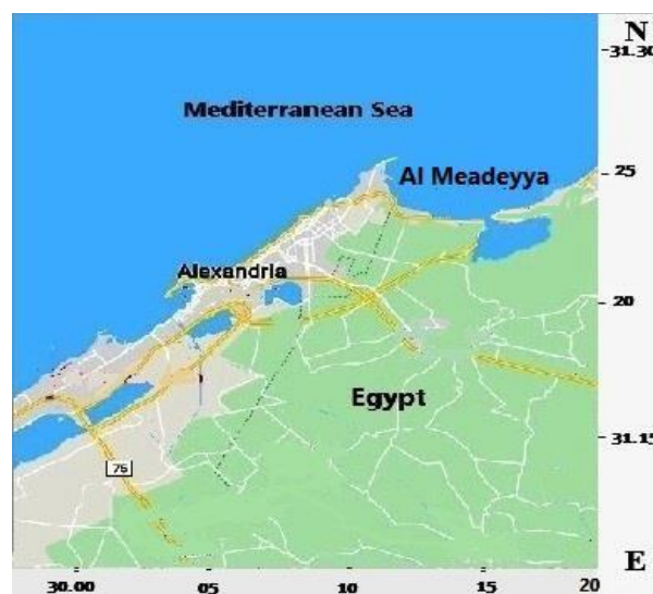
Fig. 1: Illustrated Map of the investigated area along the Mediterranean coast of Egypt (Al-Meadeyya).

Water samples were collected in clean sterilized plastic bottles and transported to the laboratory of Veterinary Hygiene and Management Department, Faculty of Veterinary Medicine, Cairo University to be stored for major chemical water quality parameters according to Standard Methods described by APHA (American Public Health Association, 2005).