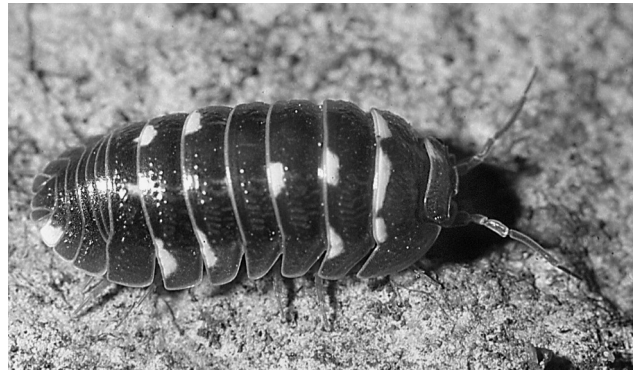
Fig. 2. Armadillidium corcyraeum , NW-Greece, Igumenitsa.

Greek records: Ionian islands Kérkira, Paxí and Lefkáda and adjacent mainland of the western Epirus (map see SCHMALFUSS 2010: fig. 30).