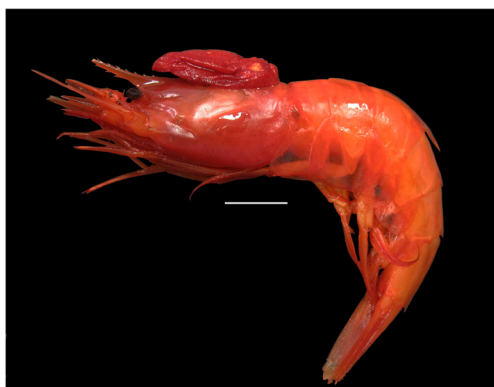
Fig. 1 Holophryxus acanthephyrae Stephensen 1912 parasitizing the deep-sea shrimp Acanthephyra acanthitelsonis Spence Bate, 1888 (lateral view), collected in Rocas Atoll, Northeastern Brazil. Scale bar = 1 cm

The material analysed of H. acanthephyrae fits with all diagnostic characters described by Stephensen (1912), Jones and Smaldon (1986) and Wasmer (1988) with the main characteristics: elongate and symmetrical body, divisible into cephalon, thorax and abdomen, although there is no distinct boundary between the thorax and the abdomen; The cephalon small, weakly notched anteriorly and not bifurcate, has a pronounced ridge visible in all dorsal and lateral views; The specimen presented no eyes, rudimentary antennules and antennae, a pereopods with a strongly curved dactylus and an oostegite at the base and only the first and fifth pairs of oostegites are visible externally, flattened crest with 12–13 spines and the abdomen is triangular with a medial ridge visible in ventral margin (Fig. 2). For the Acanthephyra acanthitelsonis the diagnosis comprises: Carapace smooth, rostrum slender with 7–9 small teeth, ventral margin armed