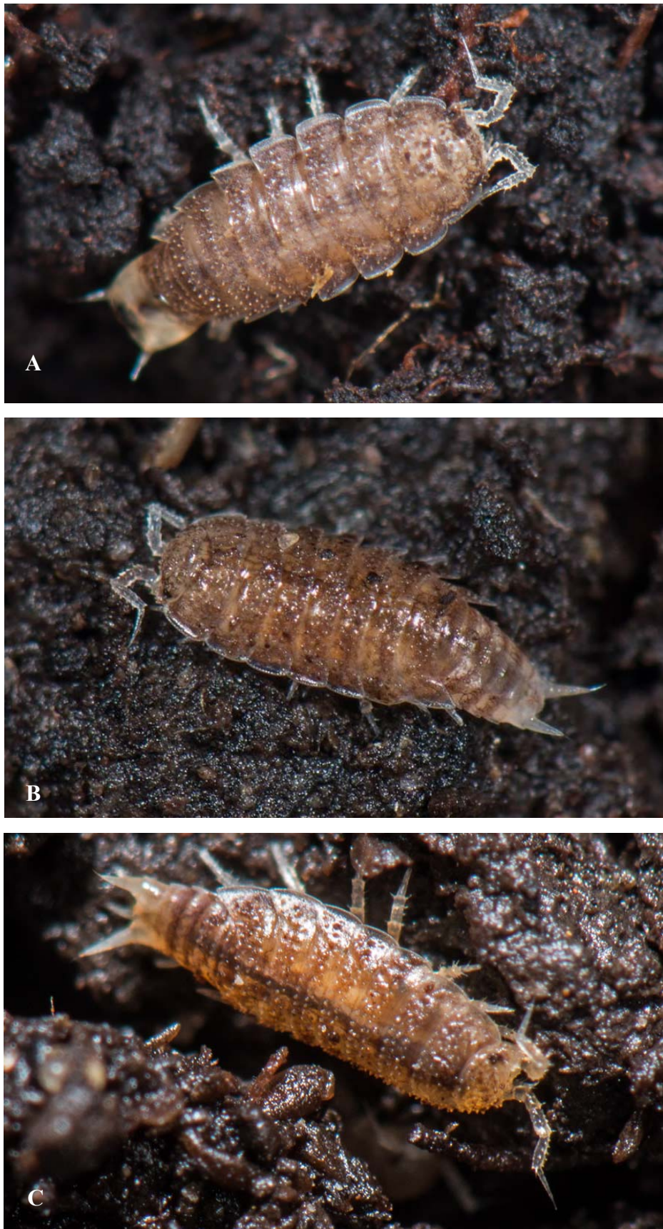
FIGURE 1: Styloniscus mauritiensis (Barnard), habitus

A) Royal Botanic Garden Edinburgh, 10.iv.2015; B) Living Rainforest, Berkshire, 12.i.2017; C) Birmingham Botanic Garden, 24.i.2017.