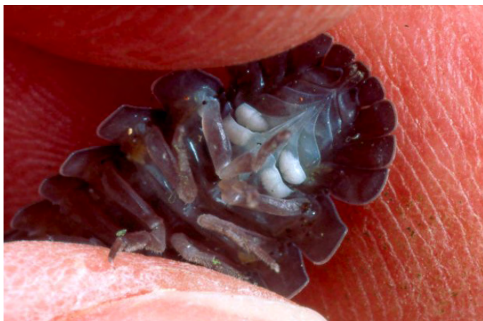
Woodlouse showing two pairs of lungs.