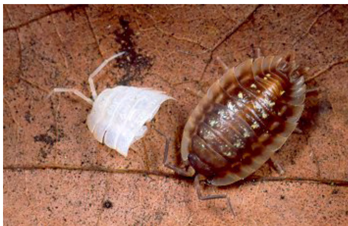
Woodlouse after moulting.

I have observed what could be described as 'fighting' over moulting woodlice, where up to four woodlice have come across the moulting individual and proceeded to pull and tug at it and push each other away until one eventually picks up the moulting woodlouse and runs (or rather staggers!) away with it. I have seen similar