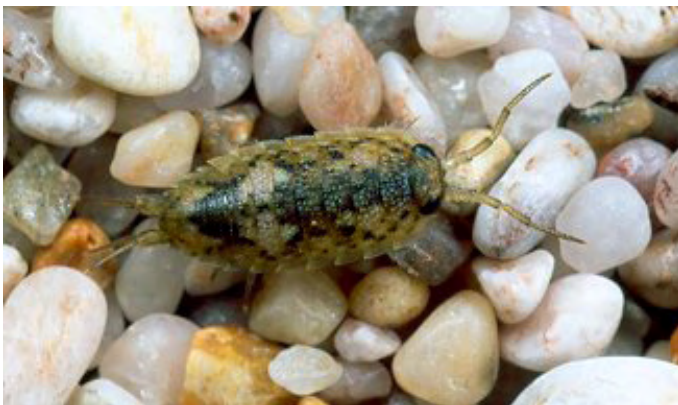
Ligia Oceanica - The Sea Slater

The earliest woodlice appear in the fossil record from the Eocene period, deposits laid down around 50 million years ago. However, it is thought that the woodlice must have evolved much earlier. The main families of woodlice have worldwide distribution and therefore must have evolved before the continents drifted apart in the Mesozoic period (c.160 million years ago). The