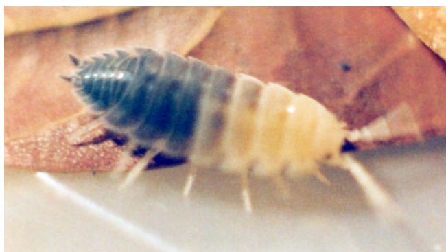
Colour variation, grey and white, Porcellio Scaber