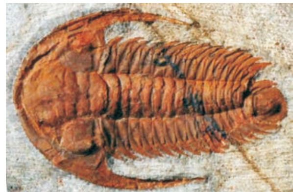
A Trilobite - ancestor of the woodlouse

Many people assume that woodlice are related to other terrestrial arthropods such as millipedes, centipedes and pseudoscorpions, but they are not. Their closest relatives are in fact crabs, lobsters and water fleas. Woodlice belong to the order Isopoda, this includes creatures that live in the sea and fresh water as well as on land. Woodlice are one of the few land dwelling groups of the class Crustacea. They are an interesting group, several common species exhibit varying degrees of adaptation to life on land, largely depending on their body structure and number of lungs (some have none, some two pairs and two species have five pairs of lungs). As crustaceans they do need to remain where there is moisture, especially during the day. All species tend to spend most of their life under logs, stones, bark, decaying leaves and in other damp, dark places, emerging at night to feed and socialise. The woodlice share their habitat with other creatures such as centipedes, millipedes, spiders, slugs, snails, pseudoscorpions, beetles, springtails and earwigs. Other