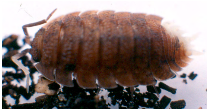
Colour variation, orange with white, Porcellio Scaber

behaviour with other food, if small pieces of a different vegetable have been placed in their tank. Within a few minutes a 'fight' has broken out with a couple of woodlice pushing each other away from the food, one woodlice (and not always the smallest) giving up and trying later.