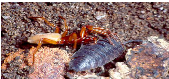
Dysdera Crocata capturing a woodlouse

furniture and intending to feast on such items until the furniture is reduced to a pile of dust - not so! The beneficial effects of these creatures certainly outweighs any damage that they do. Woodlice belong to a group of animals known as decomposers, they chew dead wood and plants and deposit these as faecal pellets which decompose rapidly, speeding up the decomposition process and quickly adding essential nutrients to the earth. They are a useful addition to any garden, helping to recycle waste and improve your garden soil!