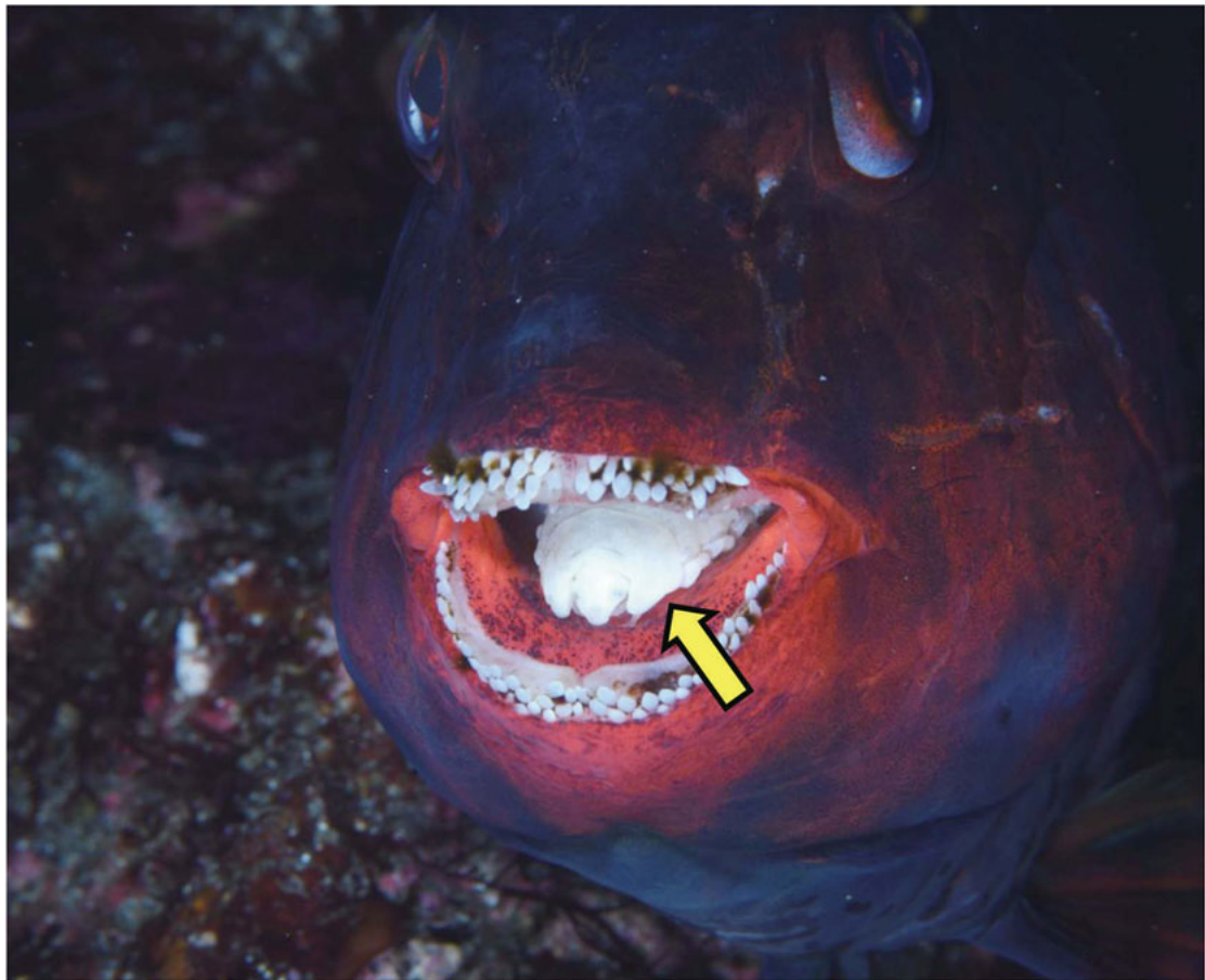
Fig 1. A live Cymothoa pulchra in the buccal cavity of the Japanese parrotfish Calotomus japonicus from Aki-no-Hama, Izu Oshima Island, 10 m depth, 16 May 2017, photo by O. Hoshino.