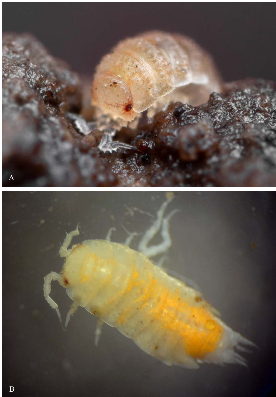
Figure 1: Trichoniscoides sarsi female specimen from Clevedon.

A) Live macrophotograph in-situ. B) Freshly preserved specimen in 80% ethanol.