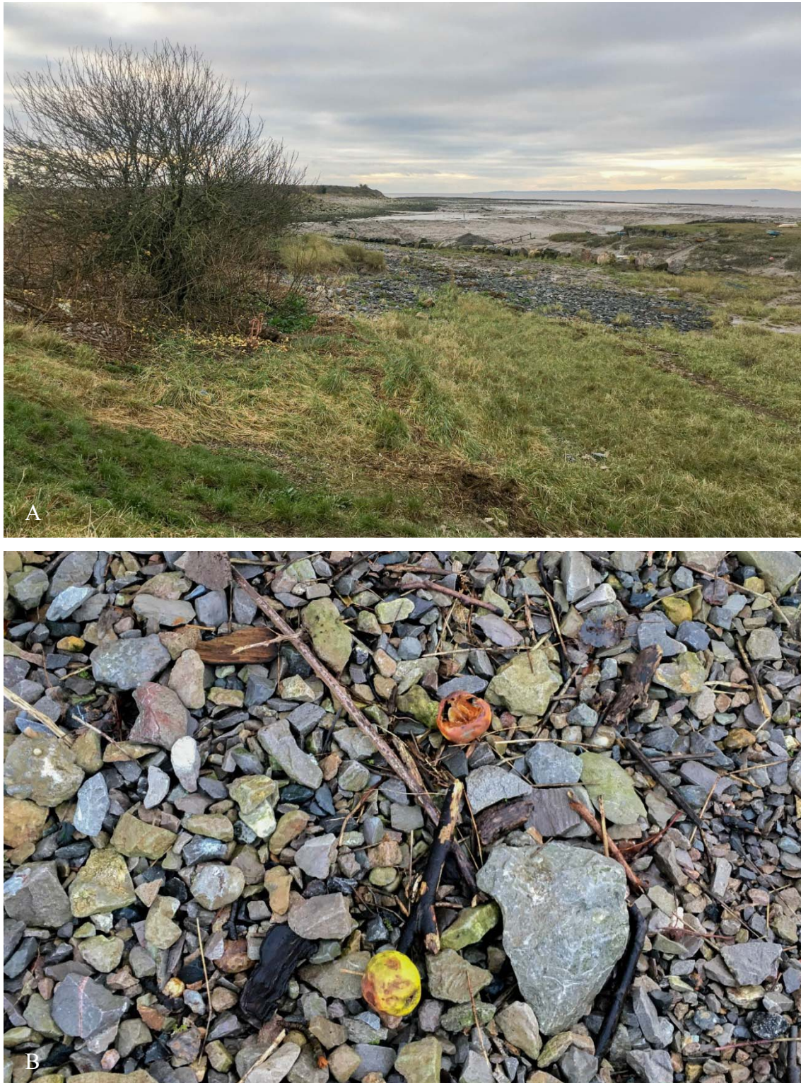
Figure 3: Habitat of Trichoniscoides sarsi on Clevedon coastline

A) Upper coastline location from which specimens were collected; B) Limestone rock microhabitat. (Images © Frank Ashwood).