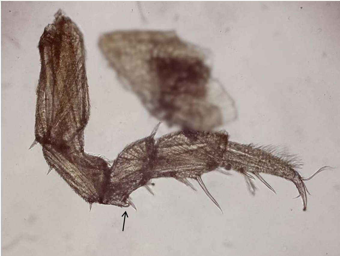
Figure 2: Trichoniscoides sarsi male pereopod 7. Specimen collected from Clevedon. Note prominent hooked spur at base of merus (arrowed).

Additionally, FA collected a specimen of a small, red-eyed, trichoniscid woodlouse from within clayey topsoil on an allotment in Horfield, Bristol (ST600763, VC34) on 06.xi.2020. The specimen was forwarded to SJG for determination and confirmed as male T. sarsi . Other species found on the same allotment plot were Metatrachoniscoides celticus Oliver & Trew (the first English record; Ashwood & Gregory, 2021), Platyarthrus hoffmannseggii Brandt, Armadillidium nasatum Budde-Lund, Oniscus asellus L., Porcellio scaber Latreille and Philoscia muscorum (Scopoli). All specimens of T. sarsi have been retained in the personal collection of FA, and record details have been submitted to the BMIG Non-marine Isopod Recording Scheme via iRecord ( www.brc.ac.uk/irecord ).