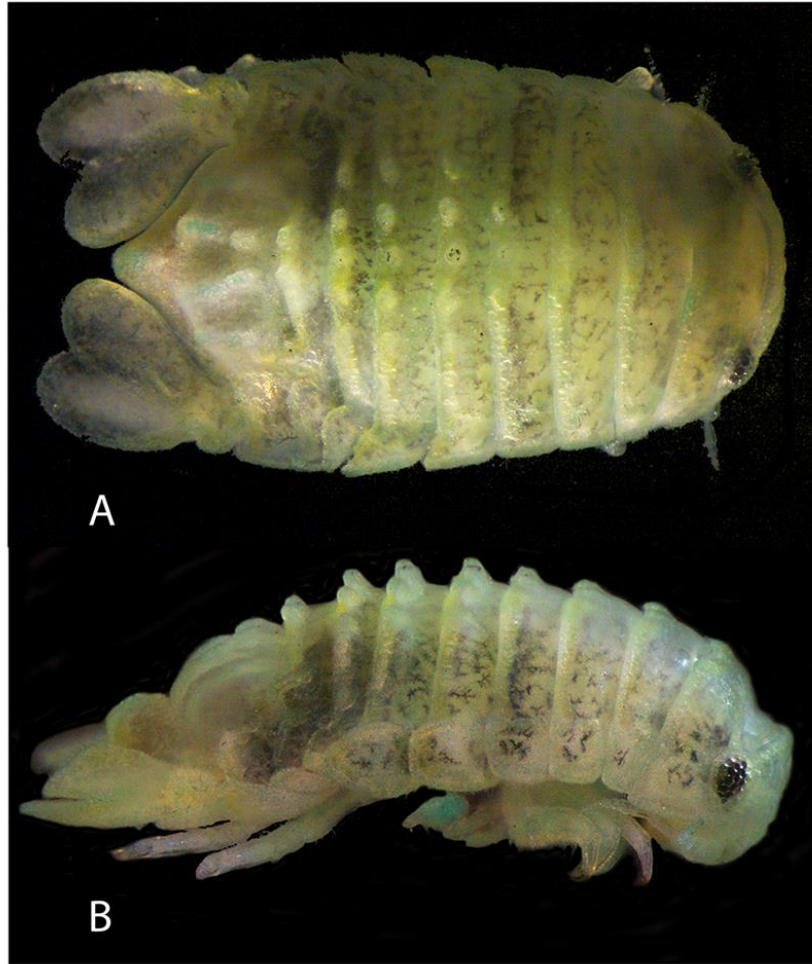
FIGURE 3. Paraimene tuberculata Javed & Ahmed, 1988: A. dorsal view; B. lateral view.